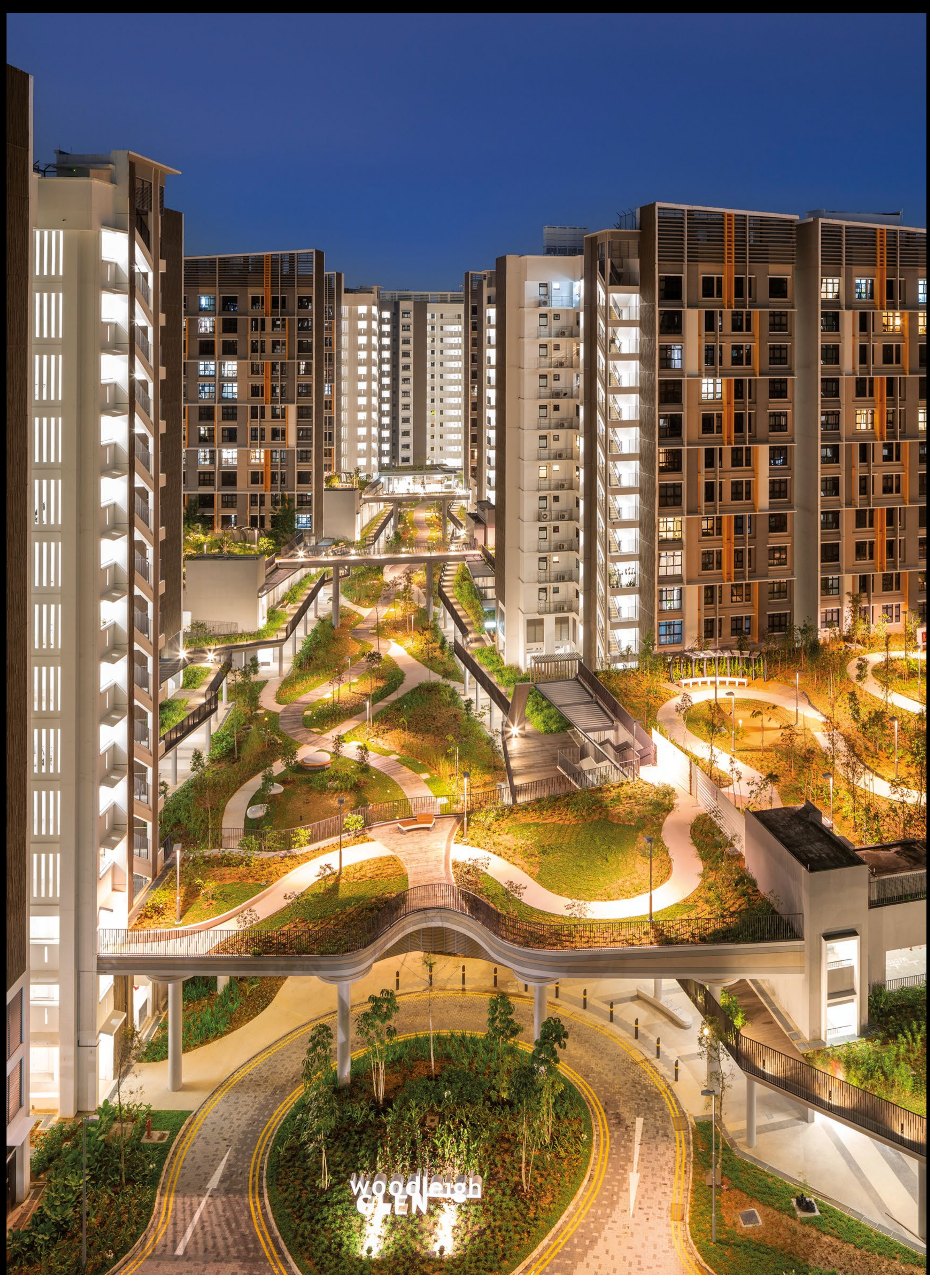
View of central valley spine with interconnected landscape trails across multiple levels

Topography The existing topography is a natural valley that slopes up towards Upper Serangoon Road and Bidadari Hill Park. The morphology of the development accentuates this undulating terrain by retaining the existing valley and inserting a series of green terraces that slope up towards the Hill Park.