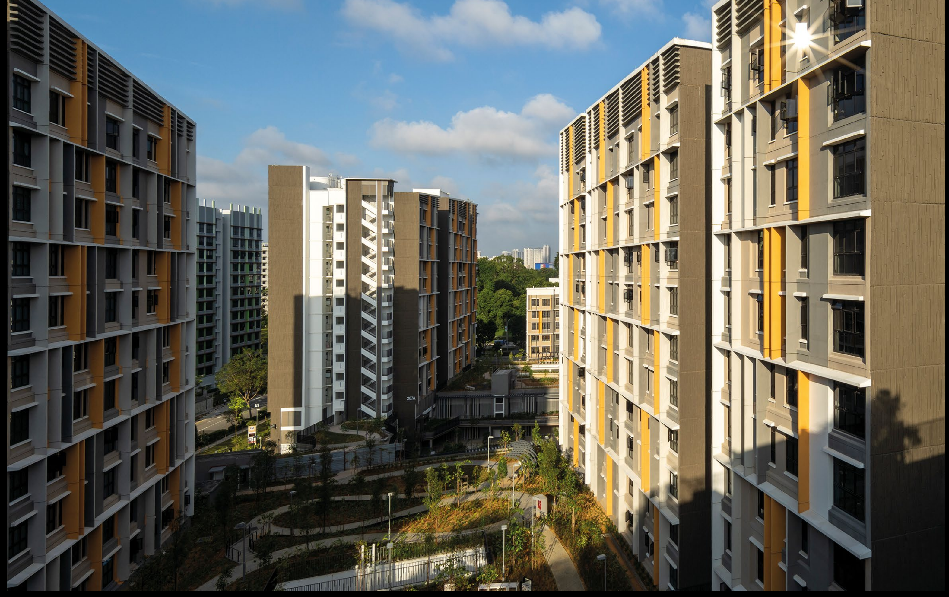
Courtyard roof gardens between residential blocks