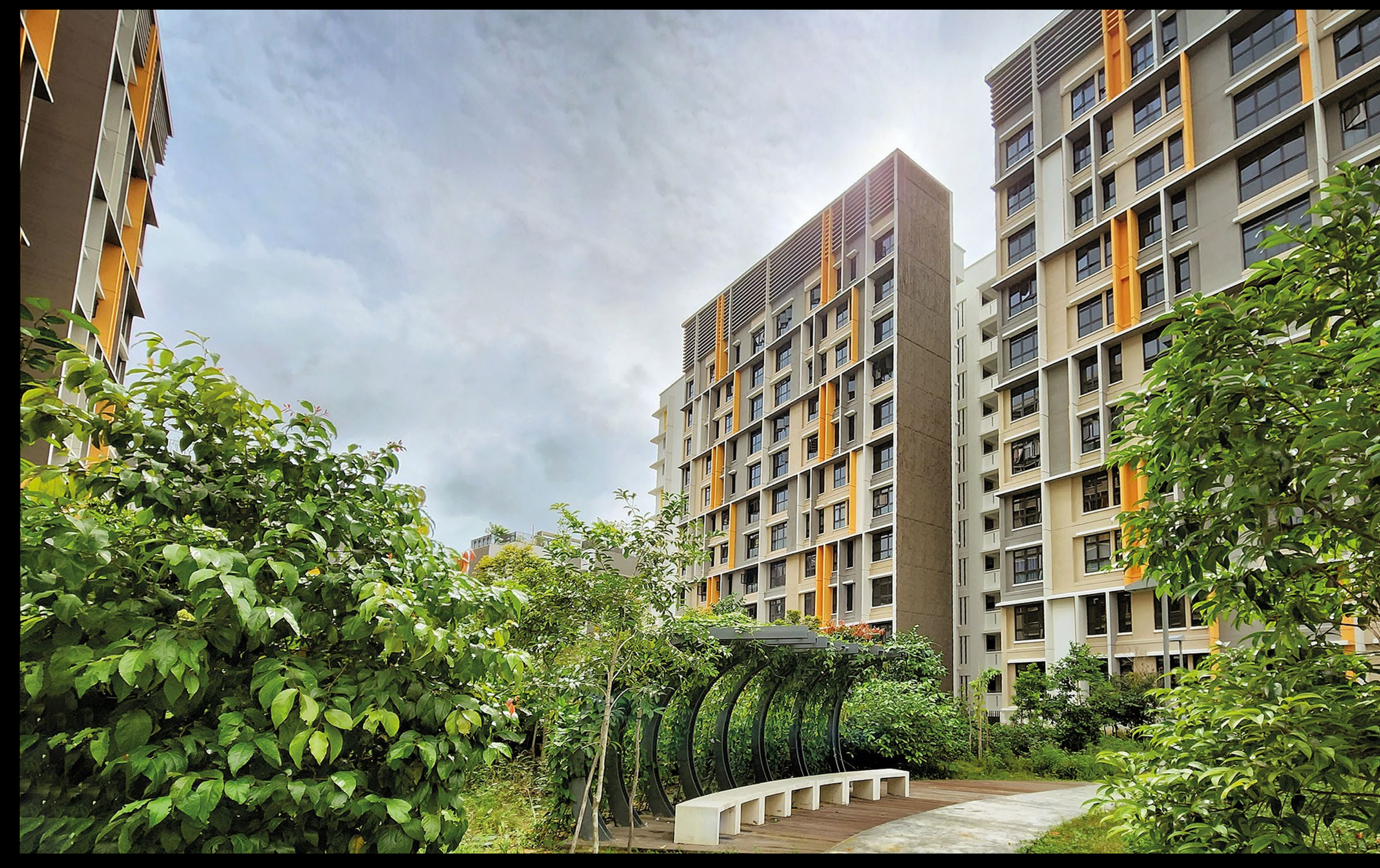
Forested rooftop courtyards act as forecourts to the residential blocks