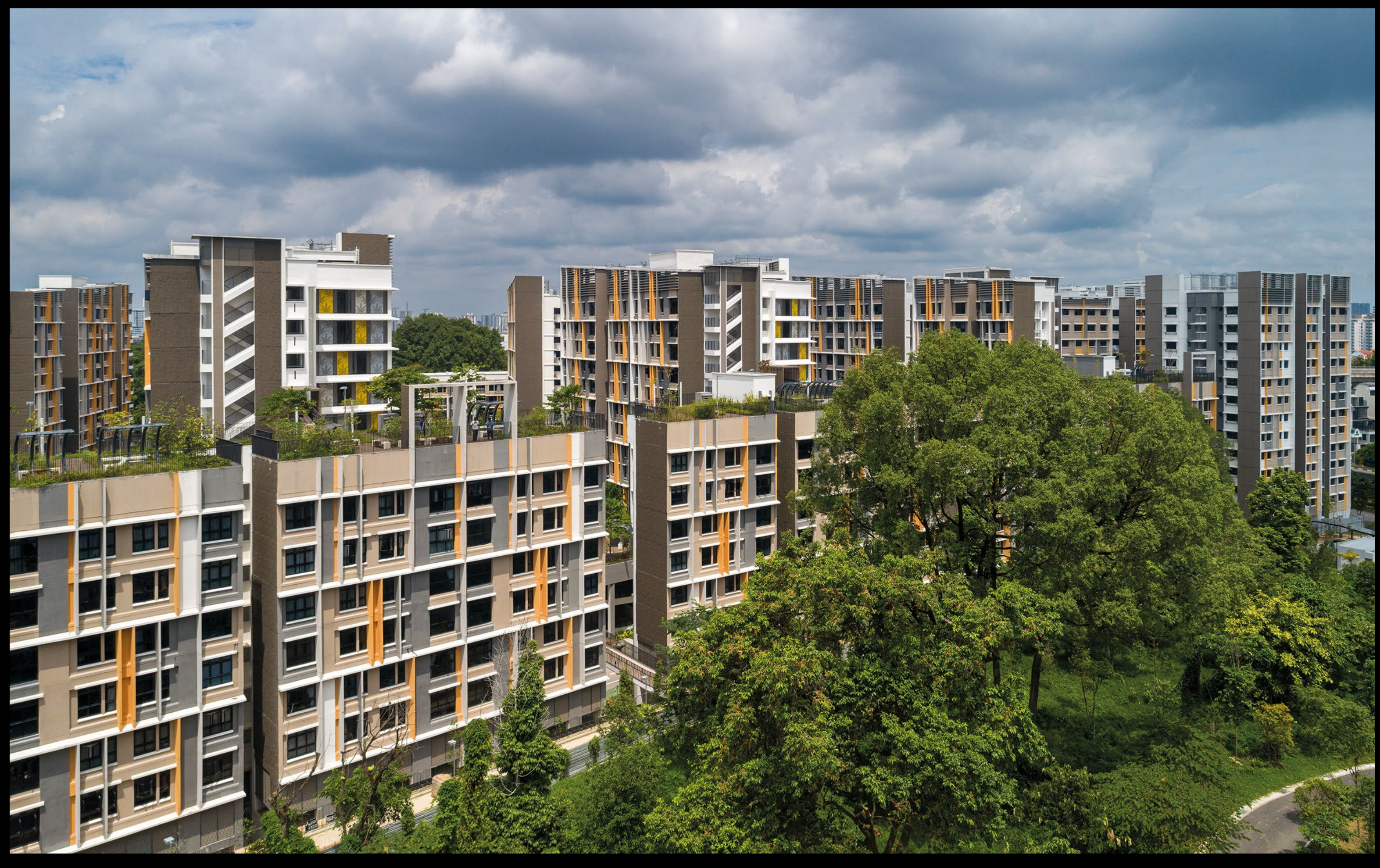
Bird-watching sky gardens facing Bidadari Hill Park